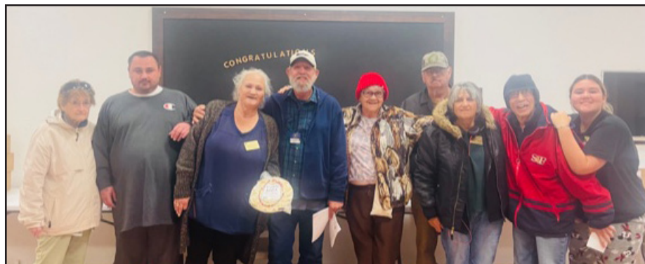
Kiwanis's volunteers distributing pies for fundraiser

meal are greatly appreciated. Call Isabel Mendoca 209 261-2279 If you know of anyone shut-in their homes and need a meal on Christmas Eve, please call Isabel and she will put them on a list.