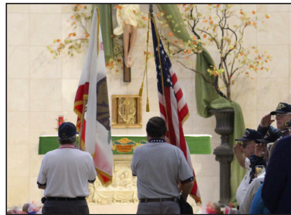
OLF's annual Veteran's Day Celebration salutes our Veterans

Congratulations to: Mercey Springs Elementary, Los Banos Junior High and to Pacheco High School."