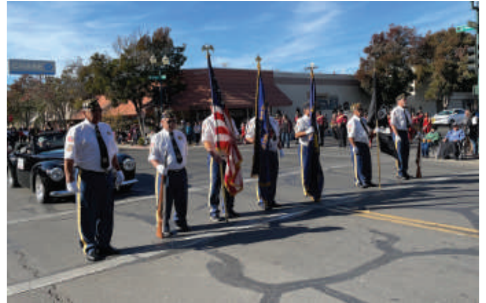
American Legion Post 166 and VFW Post 2487 ready to march in the 2022 Veterans Parade in downtown Los Banos.