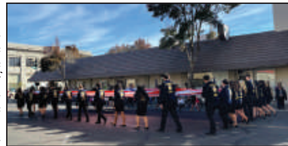
Los Banos High School/Pacheco High School FFA carrying American Flag.