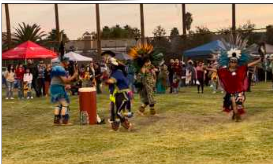
Kalpulli Izkalli Aztec dance performance at the 2022 City of LB Fall Festival.