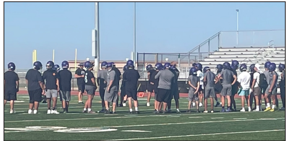
The Pacheco High Varsity Panthers football team practices Thursday afternoon, Aug. 25 ahead of their first game of the season.