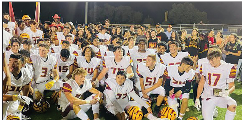
The Los Banos High Tigers varsity football team celebrates their victory over Dos Palos.