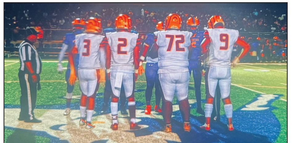
The Los Banos High Varsity Tigers team captains before last week's victory over Dos Palos.

10/21 7:00p Beyer (Modesto) Location: Pacheco High School