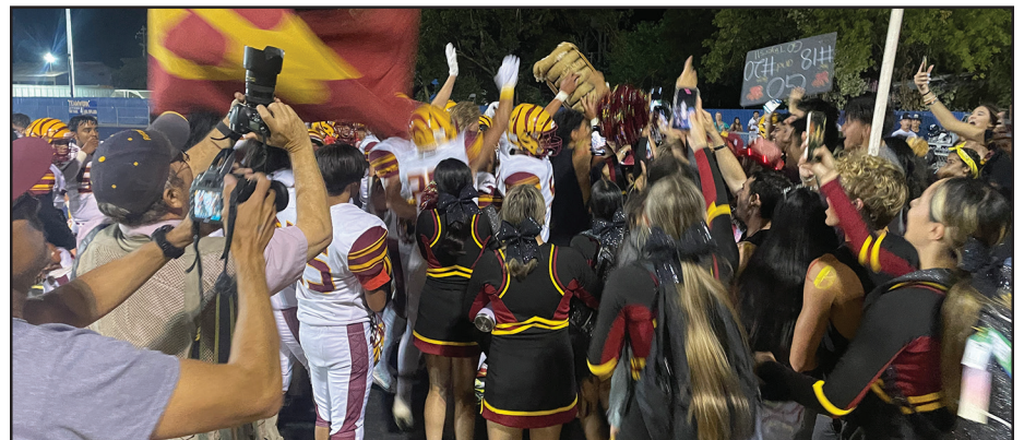
Fans cheer as the Los Banos High players hold aloft the Cotton Bale trophy following the game Friday night, August 19, 2022.

Overall great game by the Tigers, with 178 yards rushing and three touch-