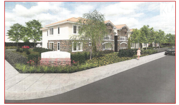
Rendered by Benchmark Engineering of 2 eight-unit, multi-family housing structures on of F Street and Santa Rita Avenue approved by Los Banos City Council Wed. night, July 6.

Resources identified four potential deficiencies in the city's GSP. The amended plan is intended to address those deficiencies.