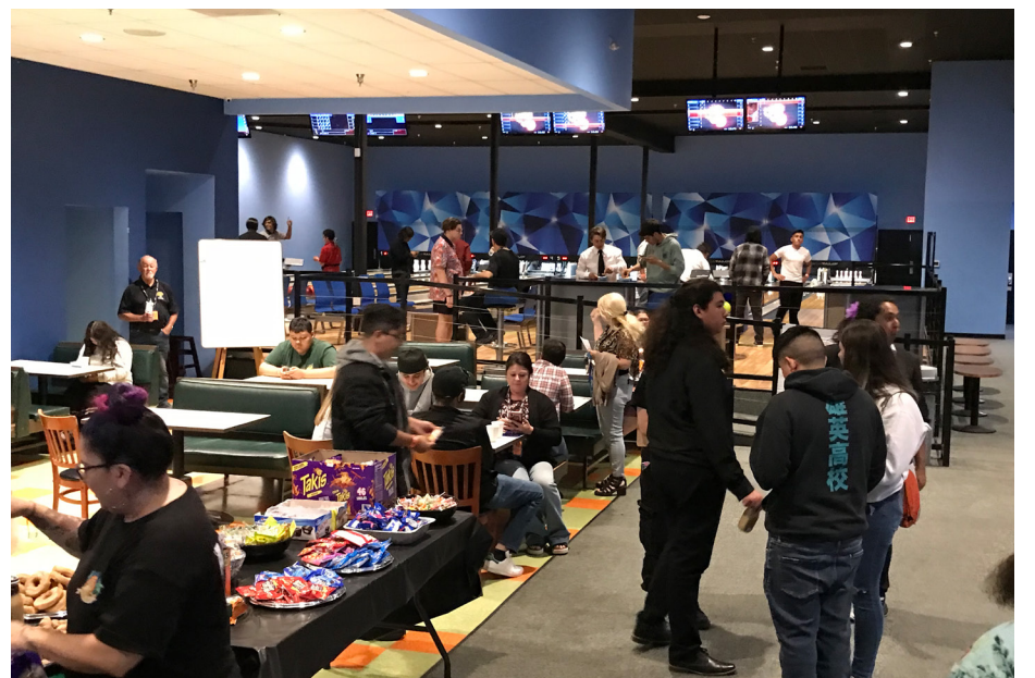
Class of 2022 grads from all high schools in Los Banos enjoyed a night of bowling, Lazer Tag, arcade games and snacks.